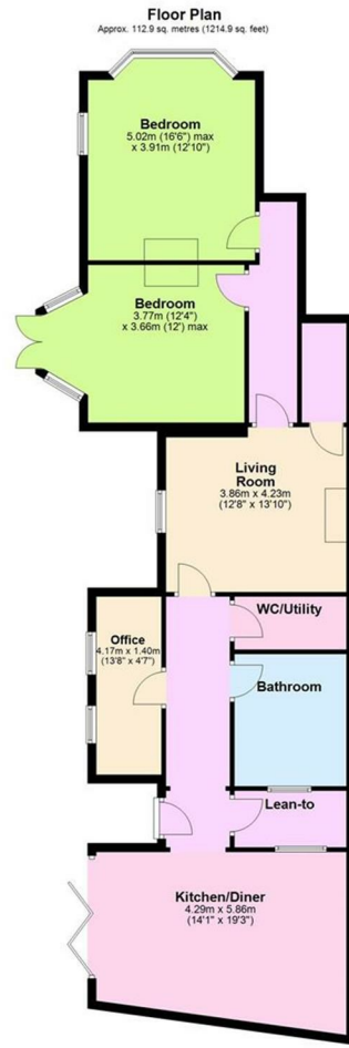
Total area: approx. 112.9 sq. metres (1214.9 sq. feet)